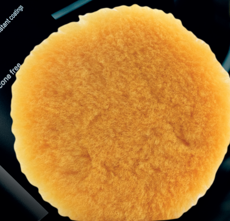
Lambs Wool Pad 150 mm