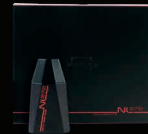
NL272 Nano Layer Ceramic Coating