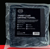
TWIST CAR DRYING TOWEL