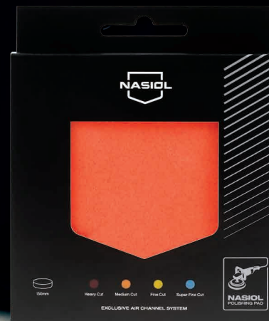
Medium Cut Pad 150 mm