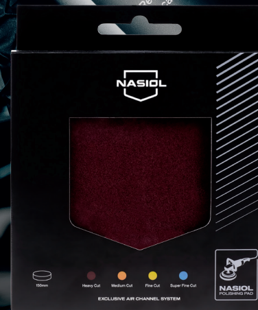
Heavy Cut Pad 150 mm