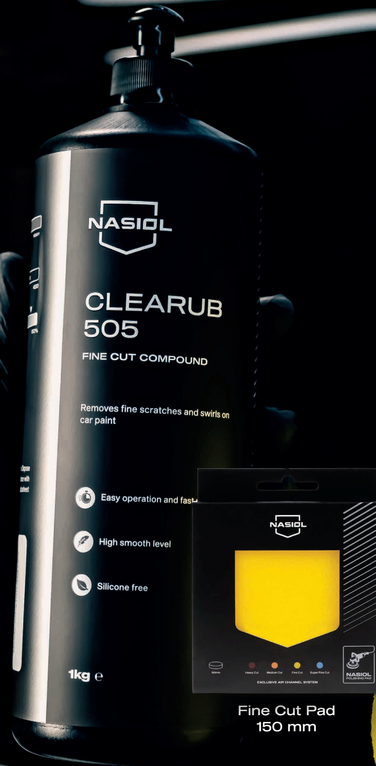
Fine Cut Pad 150 mm