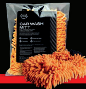
CAR WASH MITT DUAL-SIDED SUPER SOFT CHENILLE WASH MITT