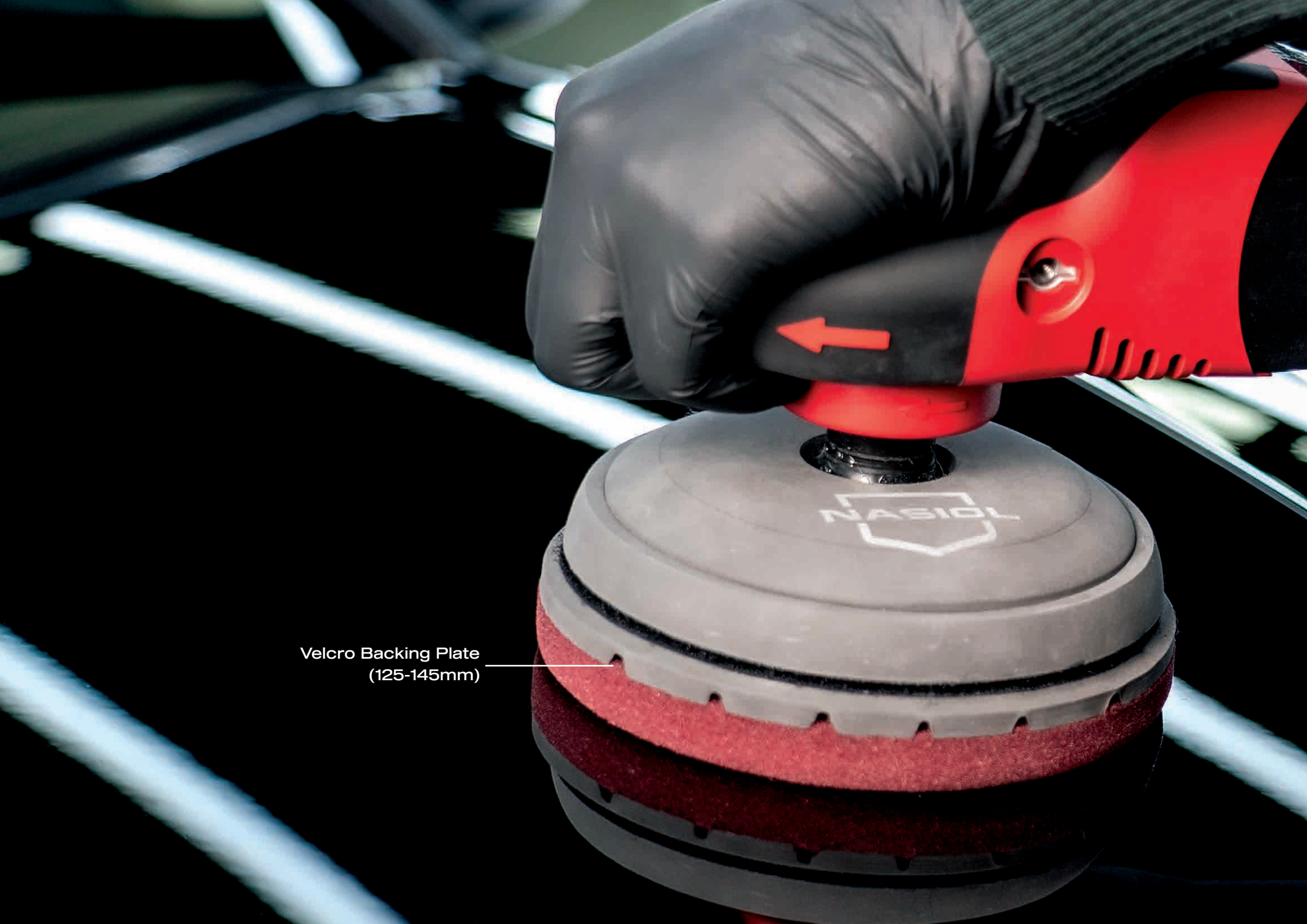
Velcro Backing Plate (125-145mm)