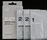
GLASSHIELD WIPE-ON Nano Rain Repellent Wipes